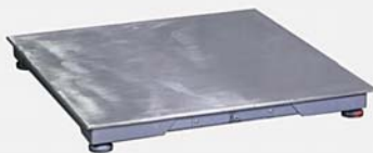
Stainless steel cover