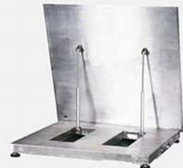
Lift s. s floor Scale