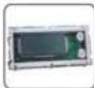
Completed Seal PBC