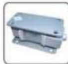
Ventilated Ring for Load Cell